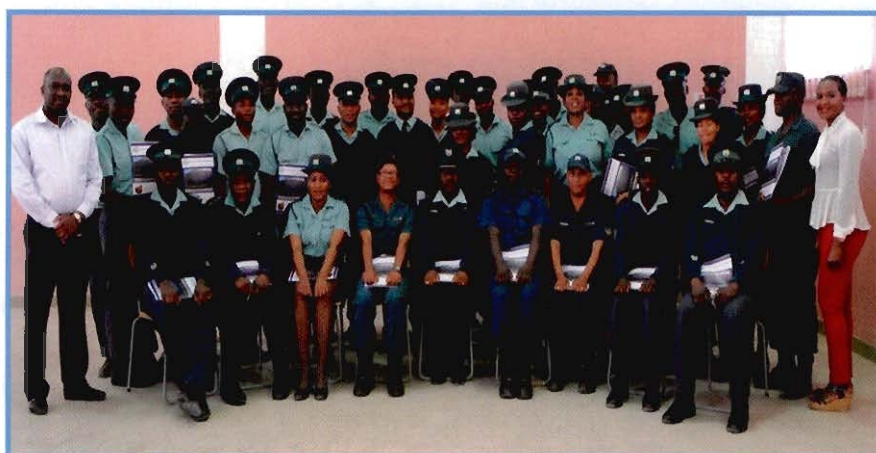
Uniformed Officials from Omaruru Correctional Services