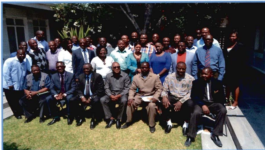
A group photo of Oshikoto RC IMT participants. Sitting: ACC Director-General with some regional councillors.