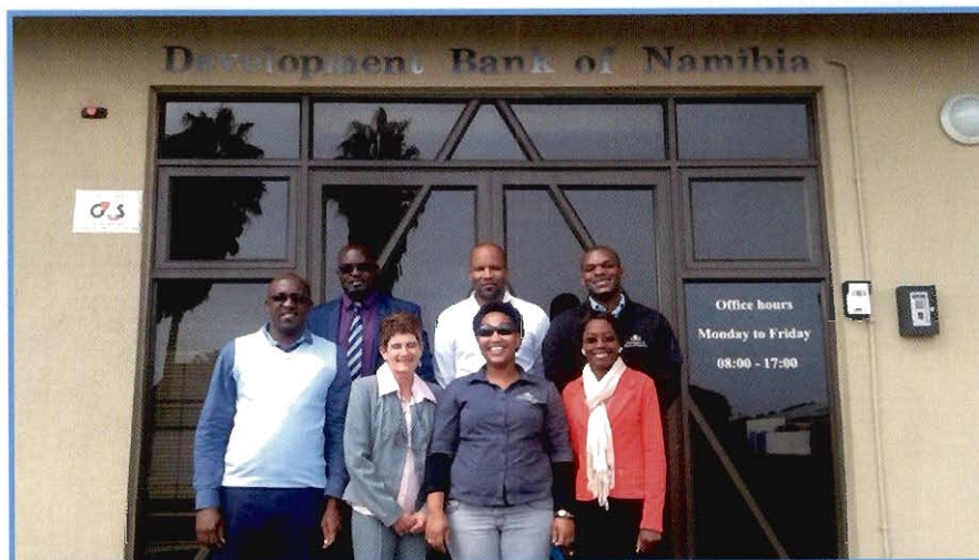
Staff of DBN Erongo Regional Office during the information sharing session in Walvis Bay

Swakopmund office conducted an information sharing session for 4 staff members of the Erongo Develop Bank of Namibia Office in Walvis Bay, in April 2015.