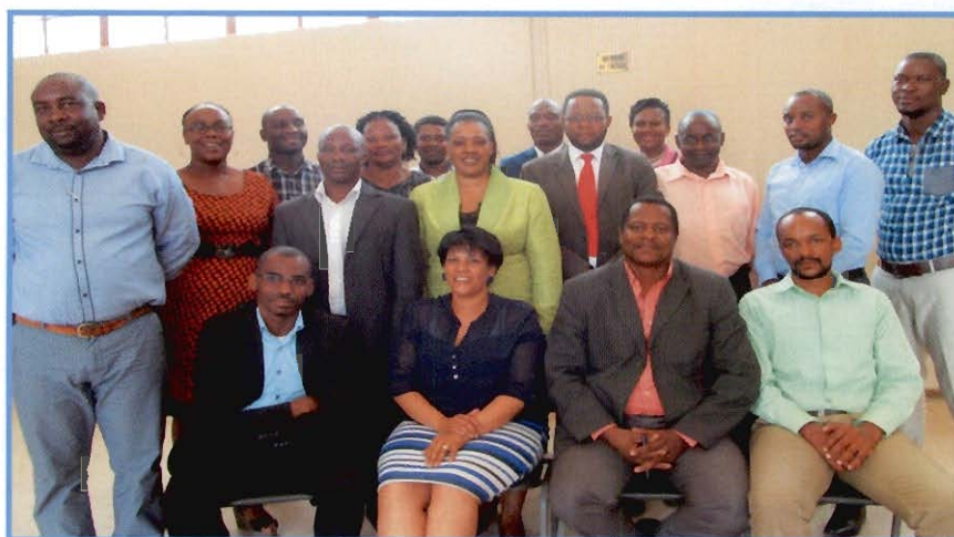
Members of Gobabis Municipality and ACC Officials attending an Integrity Management Training

The aim of the workshops was to use the integrity change process by developing business models to identify risks and find ways to mitigate them. Organizations developed their own Road Maps which they will implement. Integrity Committees were also established in each of the institutions.