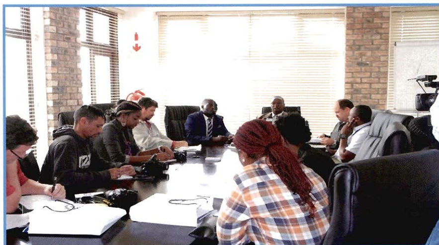
Media debriefing at the Office of the Governor of Erongo Region, Honourable Cleophas Mutjavikua

The Swakopmund office conducted the media debriefing in April 2015 at the Office of the Governor. The purpose of the media debriefing was to improve the cooperation between the office of the Governor and the ACC in fighting corruption in Namibia.