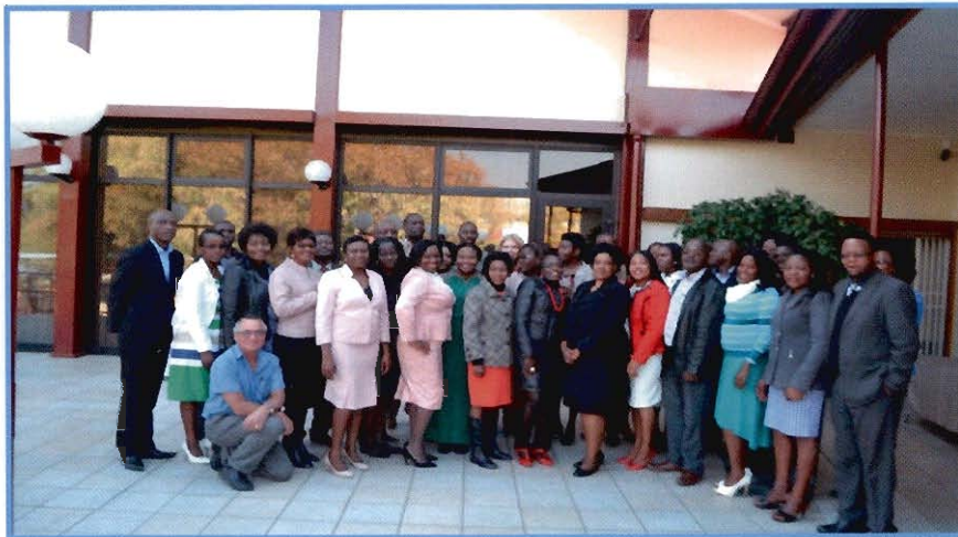
Participants at the Integrity Management workshop for the Ministry of Finance