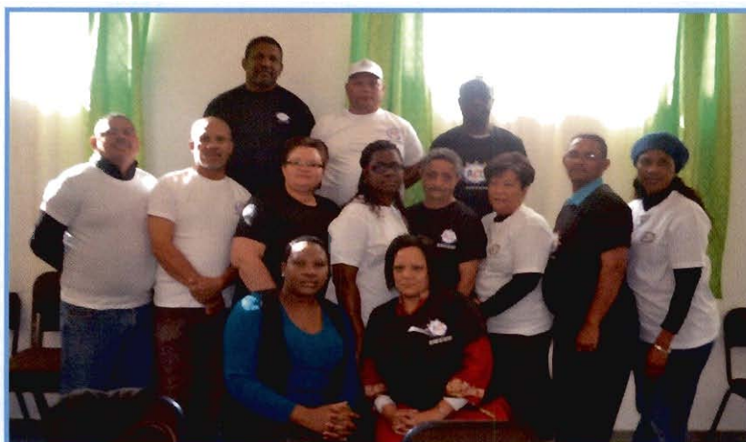
Members of the //Karas Regional Council during an Integrity Management Workshop with ACC Staff Member