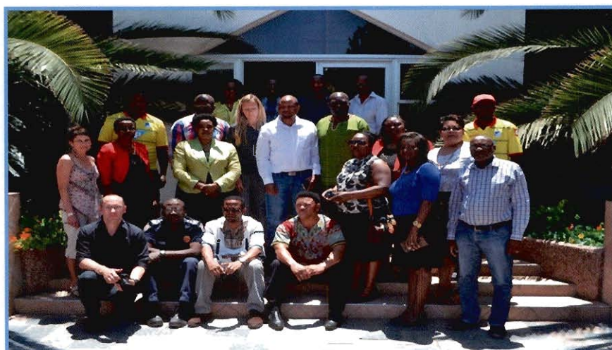
Participants at the Otjiwarongo Municipality Integrity Management Workshop in Otjozondjupa Region