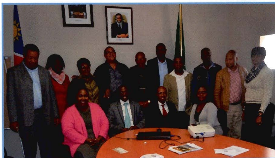
Members of the Namibia Chamber of Commerce and Industry in Otjiwarongo

Otjiwarongo office conducted a sensitization seminar for the Namibia Chamber of Commerce and Industry Members, Otjiwarongo, Otjozondjupa Region.