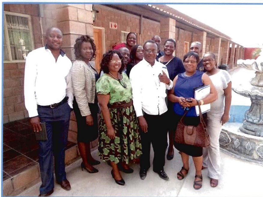
Media practitioners and ACC Oshakati officials during a seminar for media practitioners

Oshakati office conducted a seminar for media practitioners in October 2015. ACC views media practitioners as strategic and key partners in the fight against corruption due to their power to disseminate information to the masses. The main purpose of the seminar was therefore to cement this partnership. Nine journalists attended the seminar representing NBC, Informanté and The Namibian Newspaper.