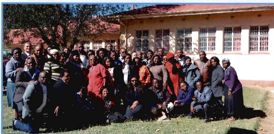
Ministry of Education (Otjozondjupa Region) officials who participated in the ACC educational session

Other sensitization seminars and presentations were done for Karibib Namibian Army & Staff College, Constituency Development Committee (CDC) Members and Ministry Officials in Omaruru, Omaruru Correctional Services Officials in Omaruru (47), Namibia Association of Local Authority Officers & Local Authority in Namibia (92), Erongo Regional Council Staff members, Otavi Town Council, Karibib Town Council and Namibia National Teachers Union Leaders, Traditional Leaders in Oshana Region (38).