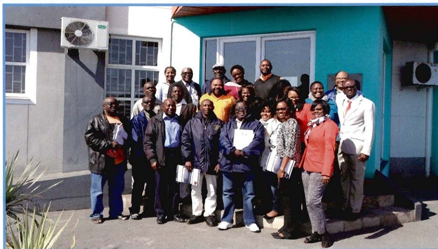
Staff of MFMR during the sensitisation seminar at MFMR Office in Walvis Bay