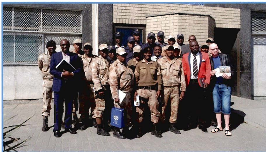
Staff members of the Nampol Erongo Head Office in Walvis Bay